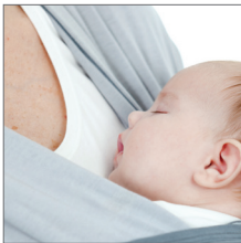
Face is visible and not pressed tightly against your body