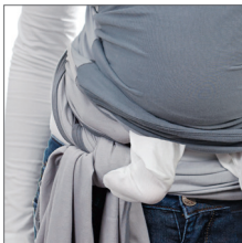
Baby is in a seated position, with knees up above bottom.