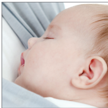
Chin is off chest and nose and mouth is not covered