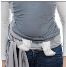
Baby is carried above your hip, fabric is spread to hollows of baby's knees.