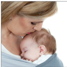
Baby is close enough to kiss their forehead