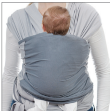
Front panel section is securing baby's entire back and shoulders